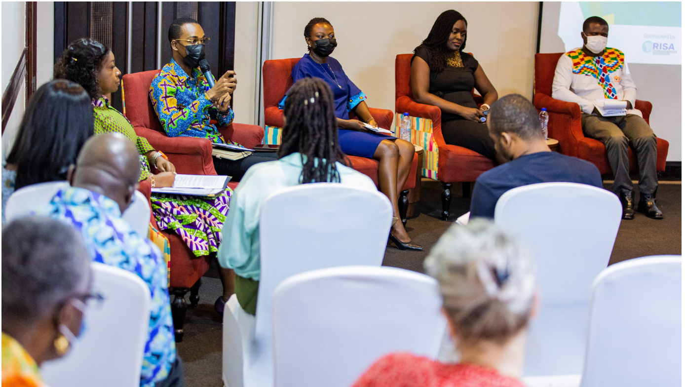
Participants at the discovery round table event on research and innovation support, organised by the Heritors Labs Ghana.