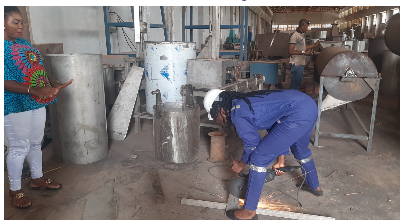
A female trainee fabricating parts of a processing machine, during stakeholders' engagement at the Products Development Institute (PRODI) in Enugu.